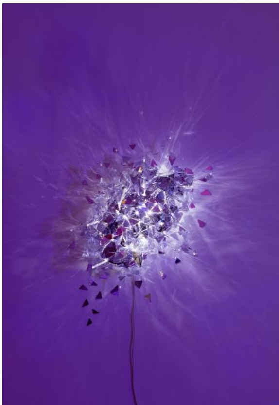
Surface Fusion, 2016, styrene, LED, Plexiglas 30 x 24 x 16 inches. Installed: 40 x 28 x 16 inches