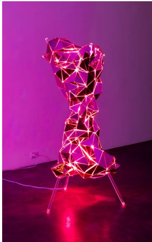
Poudretteite, 2016, Plexiglas, LED 60 x 32 x 32