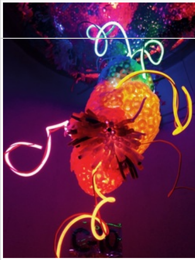
By Adela Andea

A quick background on the scene.. Inside the old Success Rice factory, (which was built in the 50s and abandoned in the 70s), lies an approximately 9,000 sq ft "Honeycomb" area at the base of 83' rice silos. The space is spectacular, creepy, and completely turns the traditional white-washed gallery aesthetic on its head. The space is different, and therefore presents a challenge, even Sculpture Month Houston's founder Volker Eisele said that it "takes guts" to exhibit there - it's certainly not for the faint hearted.